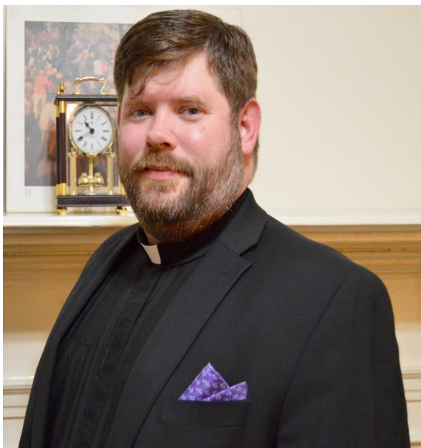
Seminarian at Virginia Theological Seminary