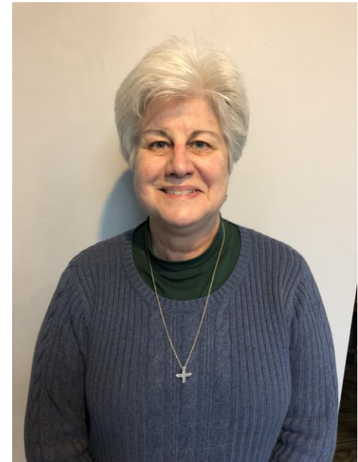
Member of St. Thomas, Monroe

I am a retired high school English teacher and am presently back at my school using my skills to tutor 9th and 10th grade students who are struggling to succeed in English. I enjoy traveling to places far and near, working in my yard, reading, and spending lots of time with friends and, especially, with my grandchildren.