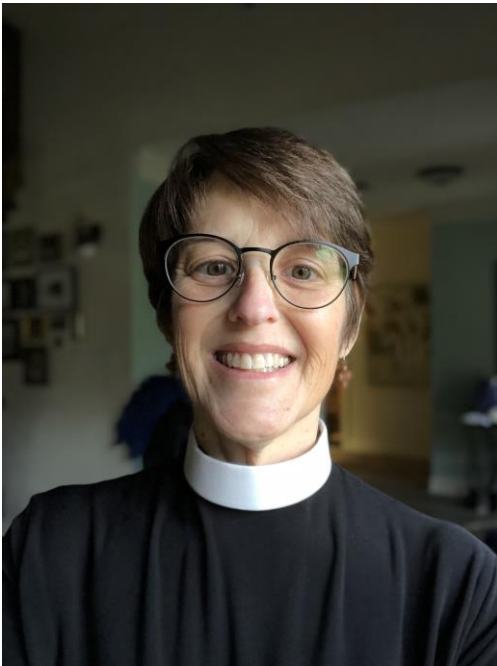
Non-parochial (attending Epiphany, New Iberia)