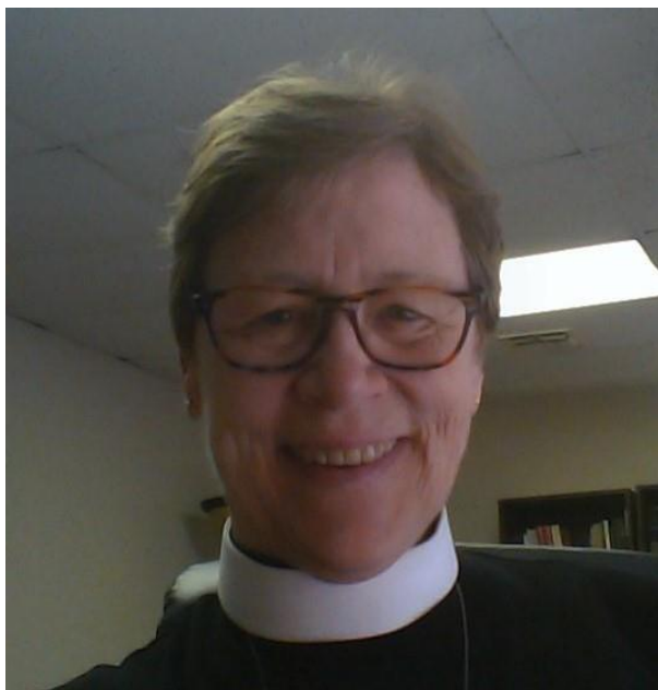
Rector of St. Paul's, Abbeville