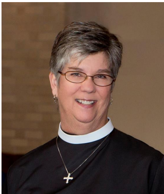
Serving St. George's, Bossier City