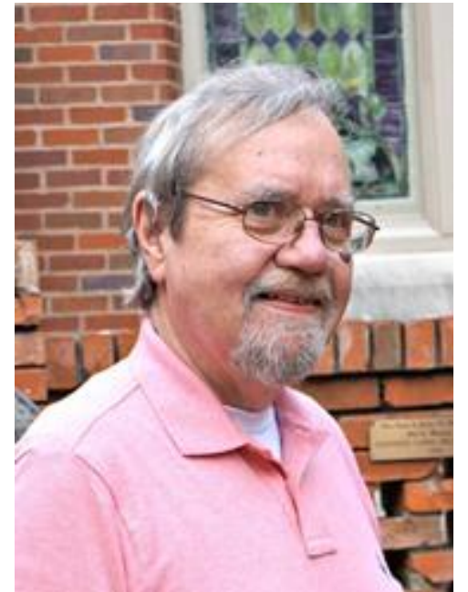
Member of St. James, Alexandria

Business background in Accounting, Banking, Agribusiness & Commercial Leasing; Associate of the Order of the Holy Cross (Benedictine); Society of Mary & the Confraternity of the Blessed Sacrament; Sewanee Alumni Association & Charlotte Manigault Society Member.