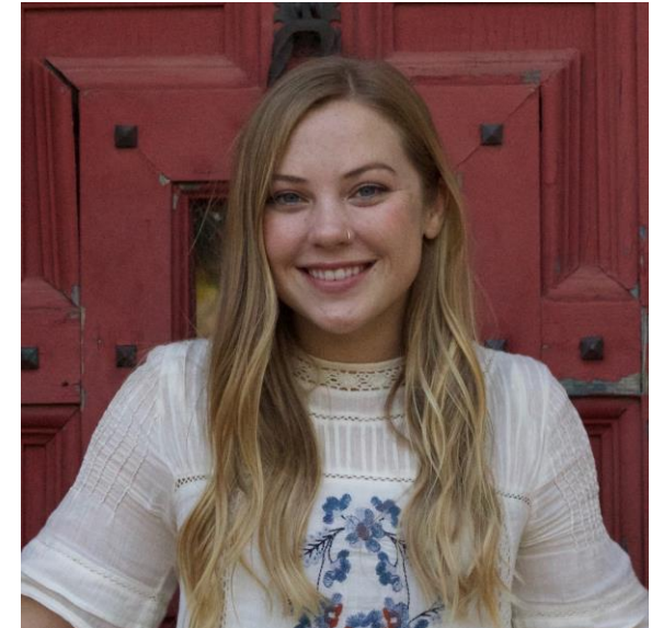
Member of St. James, Alexandria

Court Appointed Special Advocate for Rapides Parish