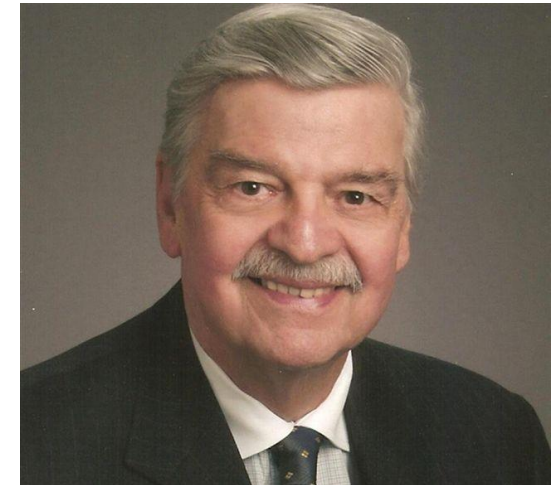
Member of Holy Cross, Shreveport

Regular study groups; attendance at Recovery meetings; physical fitness; reading; spectator sports; community theatre.