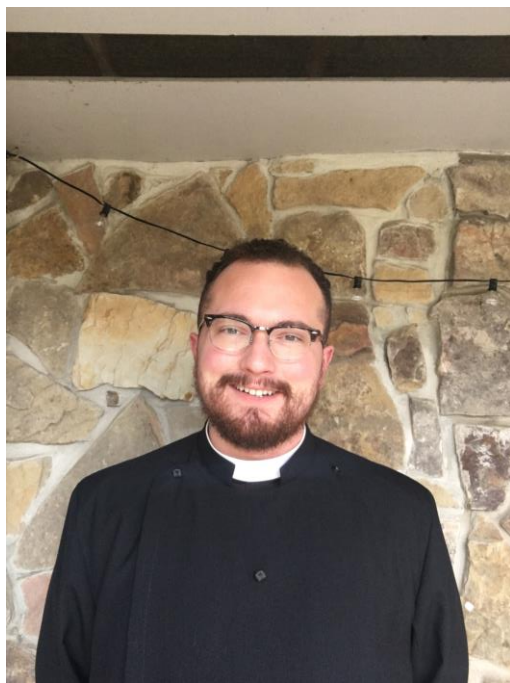
Seminarian at the School of Theology in Sewanee