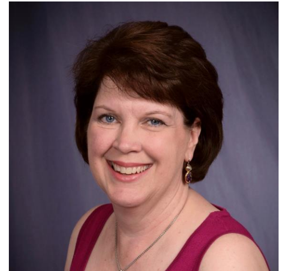
Currently worshipping at St. George's, Bossier City