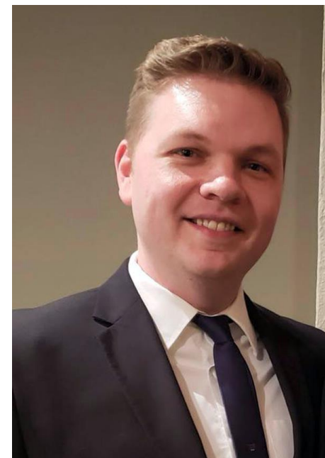
Member of St. James, Alexandria

Central Louisiana AIDS Support Services GBT Wellness Clinic, PrEP Intake A Perfect Fit Foundation, Coordinator