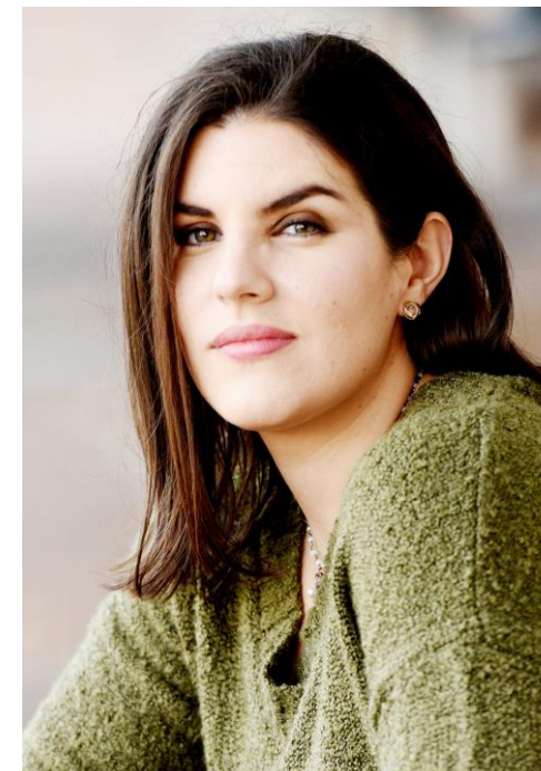
Member of St. George's, Bossier City