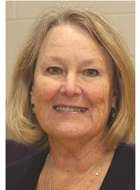
Member of St. Andrew's, Moss Bluff

Ministry at nursing home ministry, Progressive theology weekly group, retired Educational Diagnostician Calcasieu Schools, help husband on cattle ranch, help out with grandkids when I'm invited.