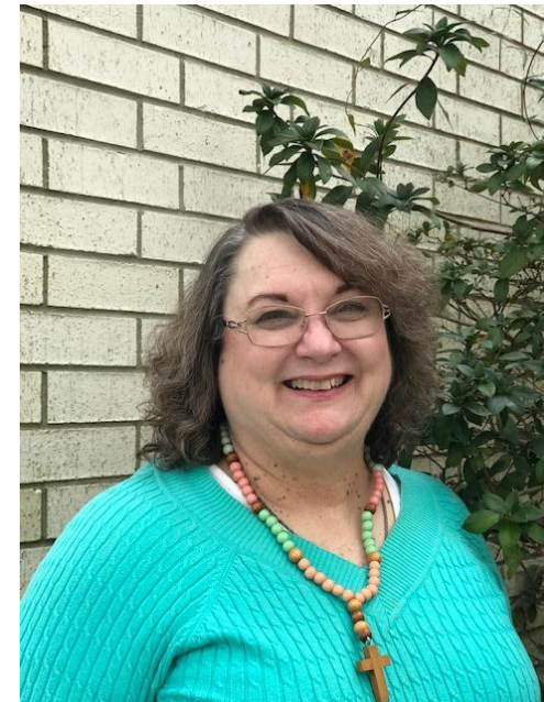
Member of Holy Trinity, Sulphur

Retired Public School Music Teacher, Choir and General Music Private Piano Teacher Married, 3 grown children, 2 grandchildren Interests: music, reading, outreach, community projects, needlework, and travel