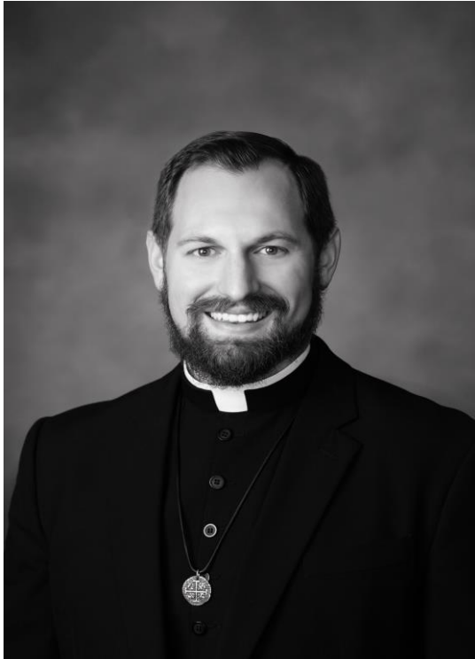
Priest in Charge at St. Barnabas, Lafayette