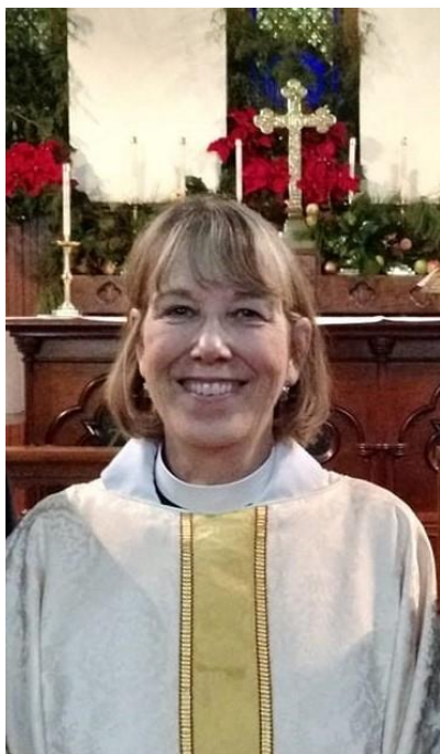
Rector of Trinity, Natchitoches