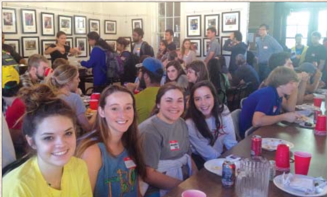
St. Alban's popular Wednesday "Lunch with C. S. Lewis," draws as many as two-hundred from all over the campus.

The students of LSU have always been the focus of our mission. Each Sunday evening, we provide a home-cooked meal for students following the 6:00 service. Our Sunday morning choir is made up of paid student singers from the LSU School of Music. The sanctuary is open 24/7 for students to stop to pray, reflect, play the piano, or to just carve out a quiet moment. We also have three active Twelve Step groups that meet here. We offer a Campus Ministry Intern Program that identifies and supports students with an interest in ministry, lay and ordained. Students from the Diocese of